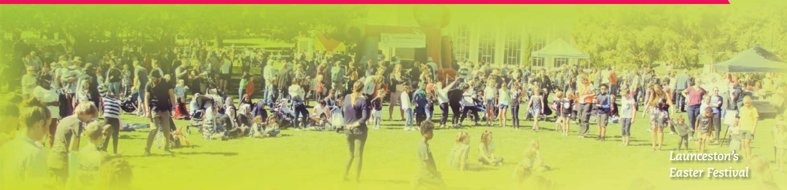
Launceston's Easter Festival

Thanks to your support, churches are being equipped to further engage with their local community through SU's ministries of camps, missions, chaplaincy, resources, and more. This partnership is at the heart of what SU is all about. Scripture Union International's Aims and Working Principles document begins with 'Working with the churches, SU aims...' We share God's mission with local churches in Tasmania to make God's Good News known to children and families and it's only through partnerships with local churches that we can implement and sustain this mission. But just how is this partnership expressed? We have asked some of our supporting churches to share how they are positively working with SU Tas to fulfil their mission in their local contexts.