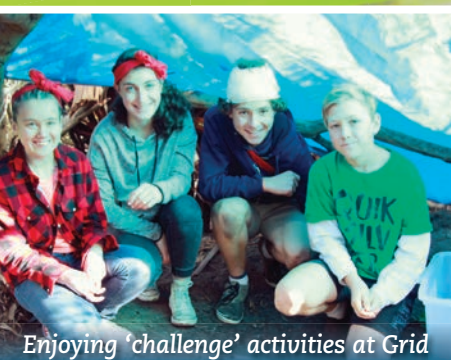
Enjoying 'challenge' activities at Grid