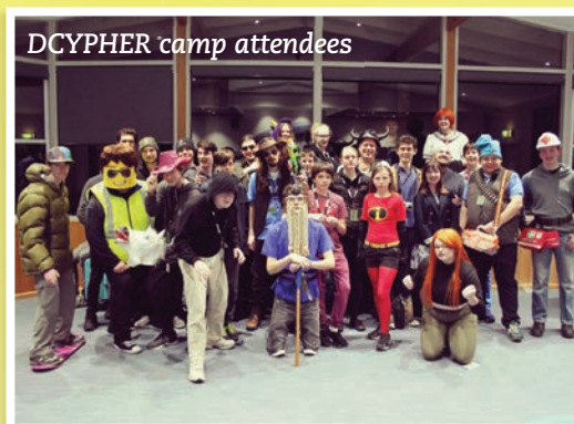
DCYPHER camp attendees

Go to www.sutas.org.au/camps to see more photos!