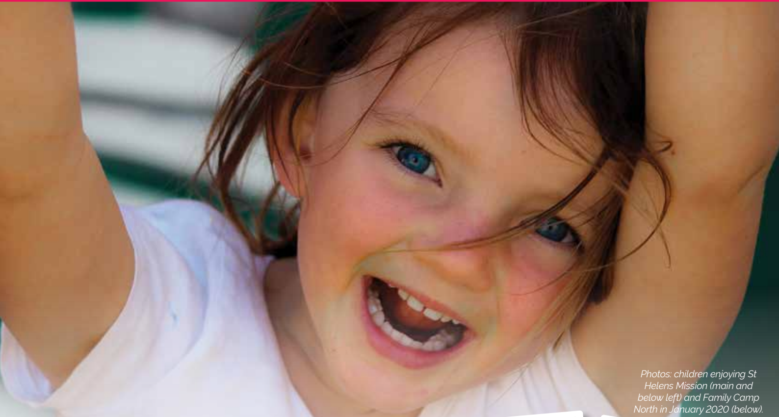
Photos: children enjoying St Helens Mission (main and below left) and Family Camp North in January 2020 (below).