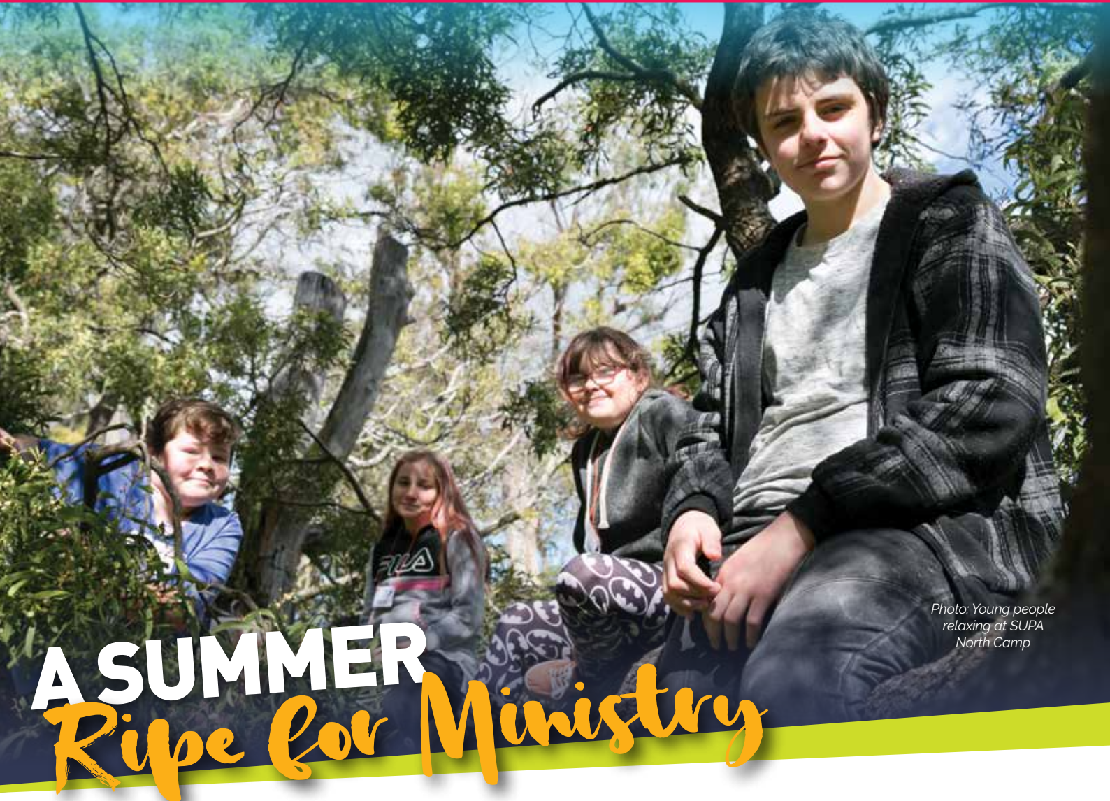
Photo: Young people relaxing at SUPA North Camp