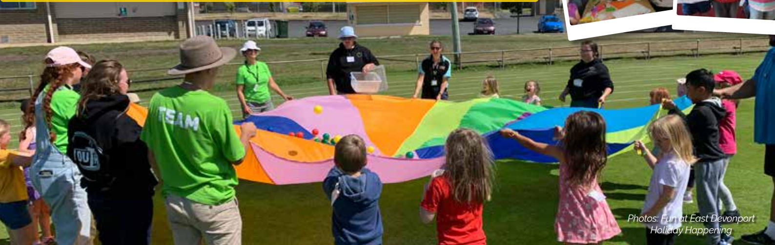
Photos: Fun at East Devonport Holiday Happening