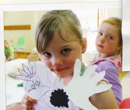
Thanks to your support, over 70 children heard about Jesus at this year's East Devonport Holiday Happening.