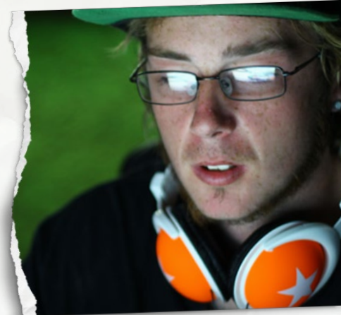
Dcypher reaches young people who might otherwise slip through the cracks.

The round table discussions at tea time at this summer's camp were a great way to get kids talking about who God is, how (or whether) they relate to him and how he interacts with the world in general and us specifically. Please pray that the seeds of the Gospel planted in the hearts of our campers would grow in the weeks and months to come!