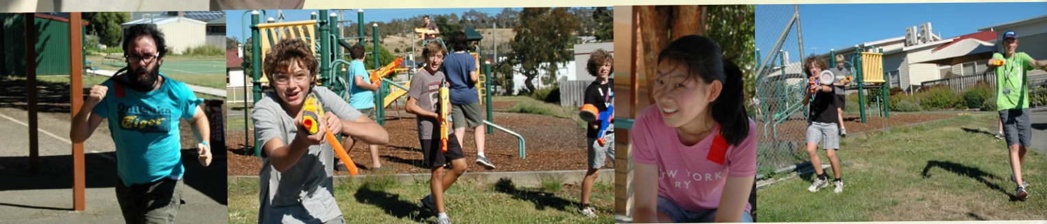
Many lives were impacted over summer because of YOU. Thank you for giving and praying to make this possible!

I think Beach Mission is a great opportunity to lay some of the groundwork in explaining the Gospel to the kids so that they can ask questions and be encouraged to start or move on in a journey of faith. It's just so rewarding!