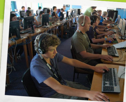
Dcypher North gave many high schoolers the chance to connect with Christ and other students.